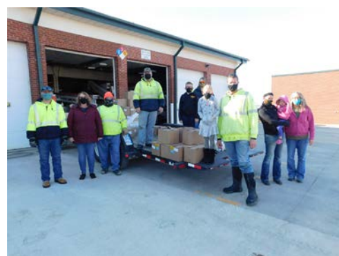
T.I.P. employees partnered with the Grinnell Food Coalition to help distribute food boxes and milk.

Due to Covid-19 the above electrical safety materials and a safety video were delivered to the schools in our service territory instead of having our in person safety presentations.