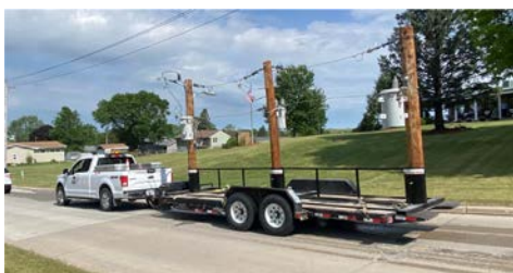
The Live Line Demo in Brooklyn Flag Festival parade.