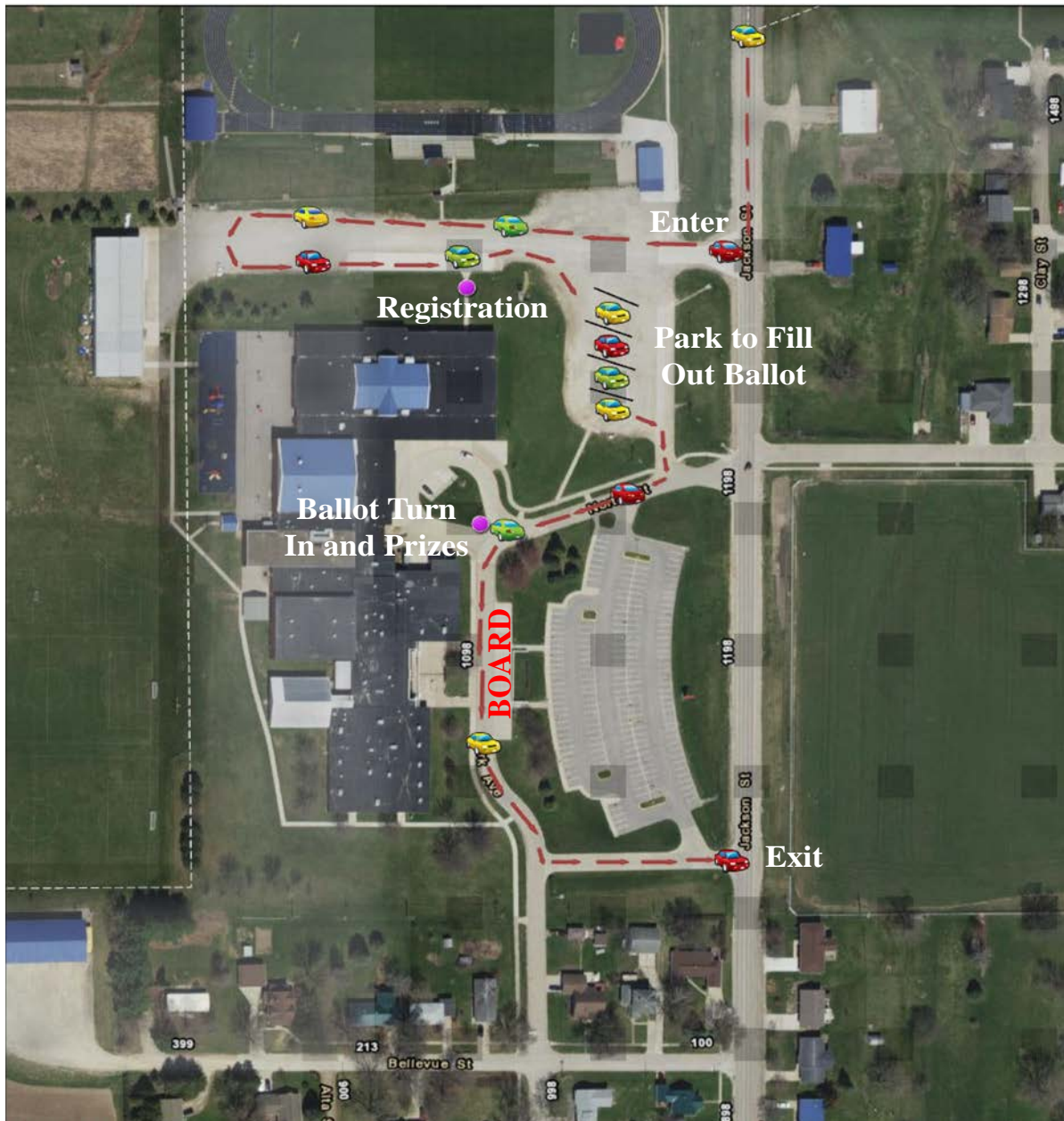
T.I.P. Annual Meeting Route

We recommend that you come to Brooklyn from the north on Highway 6. You will pull into the Annual Meeting entrance at the BGM campus on Jackson Street using the north parking lot next to the football field. From there you will be guided through the event by our employees. At the end you will exit onto Jackson Street at the south end of the BGM campus. Our goal is to move the vehicles through the event from start to finish in 10 minutes.