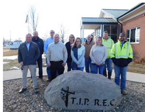
Donations were made to Big Hearts 4 Tiny Hands and First Resources Corp. on behalf of the above T.I.P. employees via our volunteer hours program.